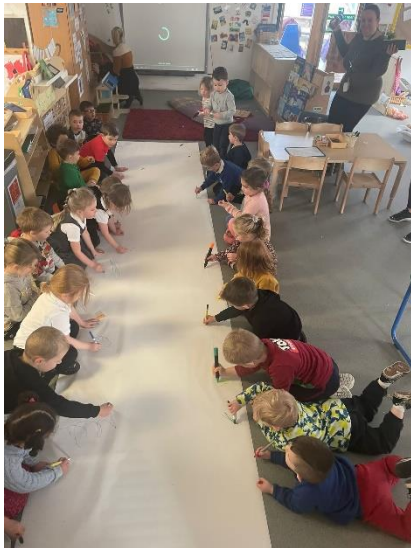
Pen disco! Improving our mark-making skills.