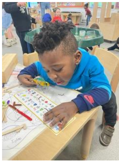
Literacy - letter formation.