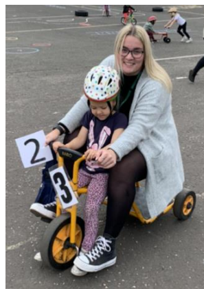
Having fun outdoors.