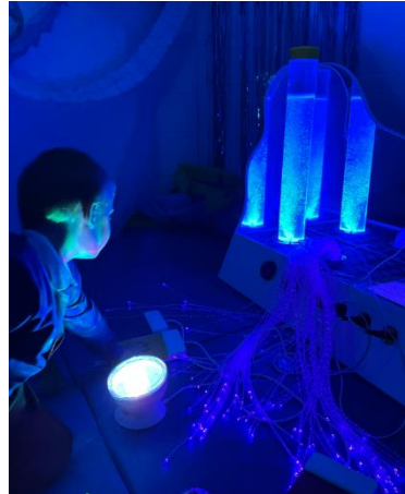
Exploring the sensory room.