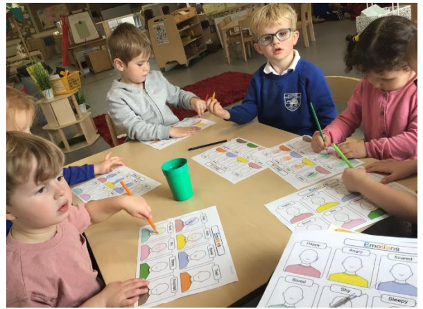
Discussing our emotions.