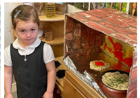
Welcome to our Pizzeria - what is your favourite pizza?