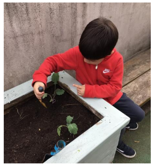
We did some gardening in the poly tunnel and planted seeds in our vegetable plots.