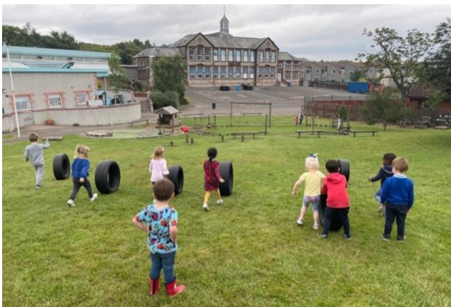
Rolling tyres down the muddy hill.