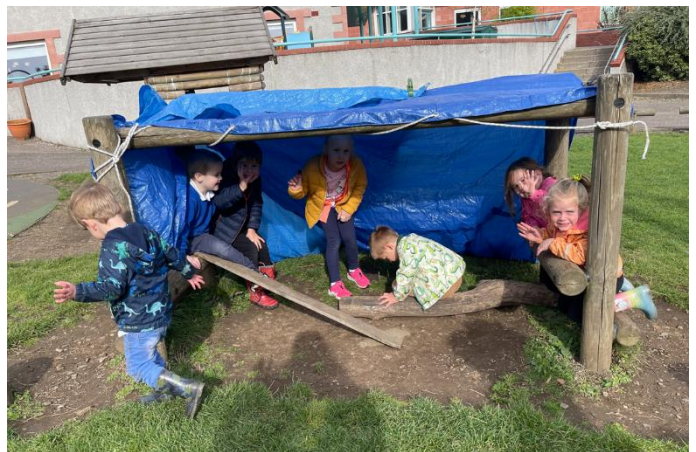
We made a den over the climbing frame, using a tarpaulin.