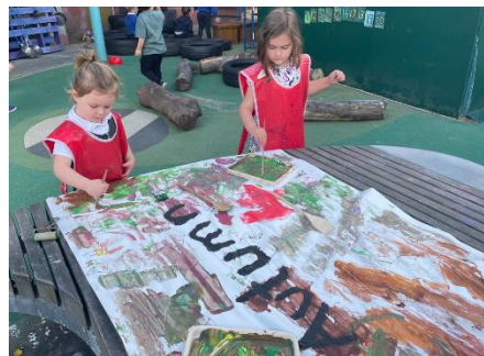
Autumn has arrived!