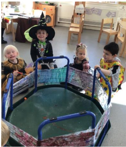
Painting on plastic