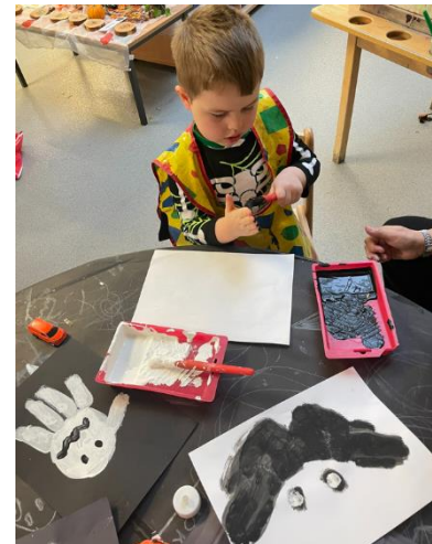
Printing with our hands

Children are active participants in their learning. (ELC Action Plan)