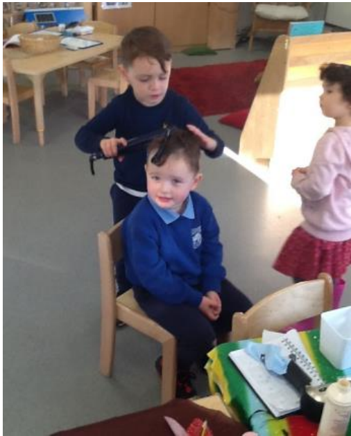
A visit to the hairdressers