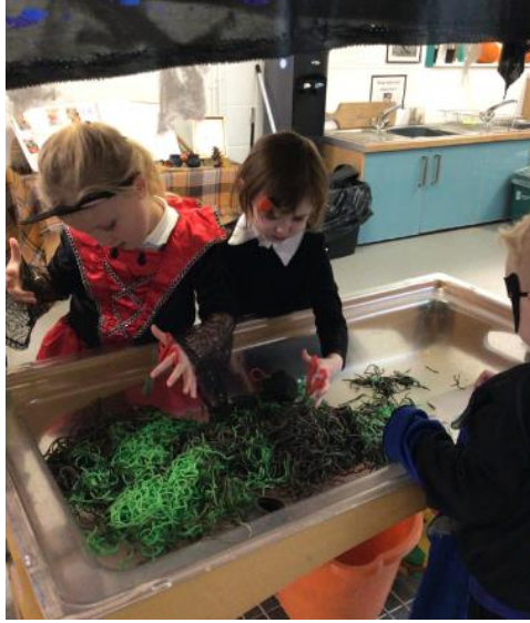
Sensory tray - slimy Spaghetti worms!