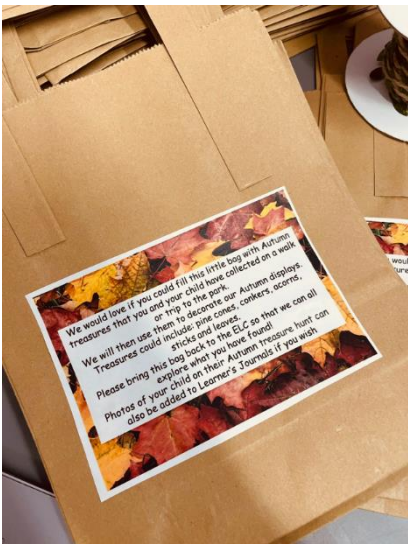
Autumn Walk - Home Learning Task