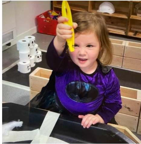
Spider fine motor skills!