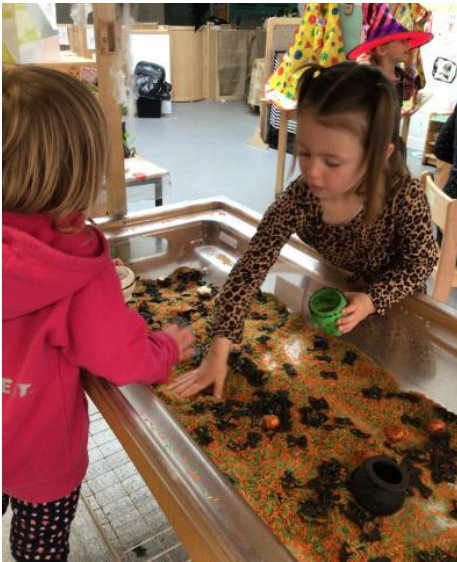
Sensory tray - rice and spiders!