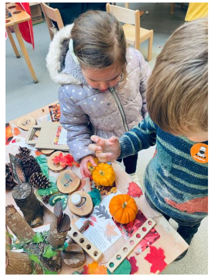
Look what we have gathered for our Autumn table...