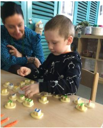
Literacy - learning sounds