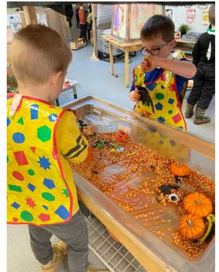
Sensory tray - Baked beans!