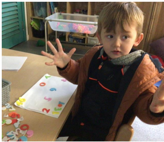
Numeracy - counting within 10