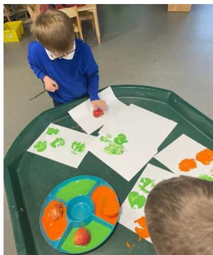
Printing with fruit