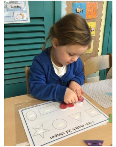
Maths - 2D shapes