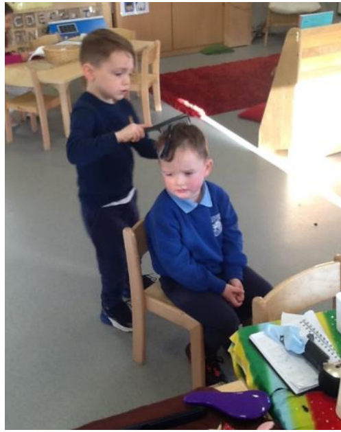
Just adding the finishing touches...