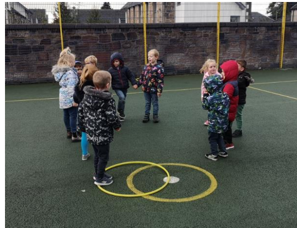
Team work at the Muga

Children have the opportunity to explore number in a fun and active way.