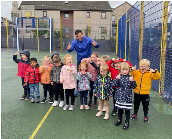
Ball skills at the Muga