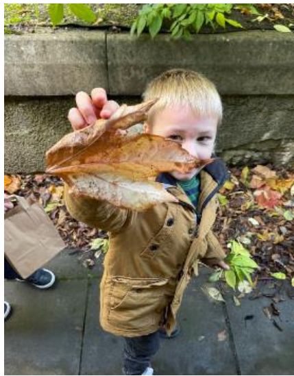
Finding leaves in our playground